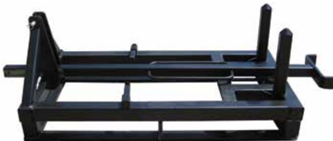
FR Series Boom Stand Collapsed

The FR Series Boom Stand holds the boom securely when the boom is not being used. The Boom Stand also has a collapsible front support for easy transport and storage, and at maximum spread the forks straddle the boom stand for ease of alignment.