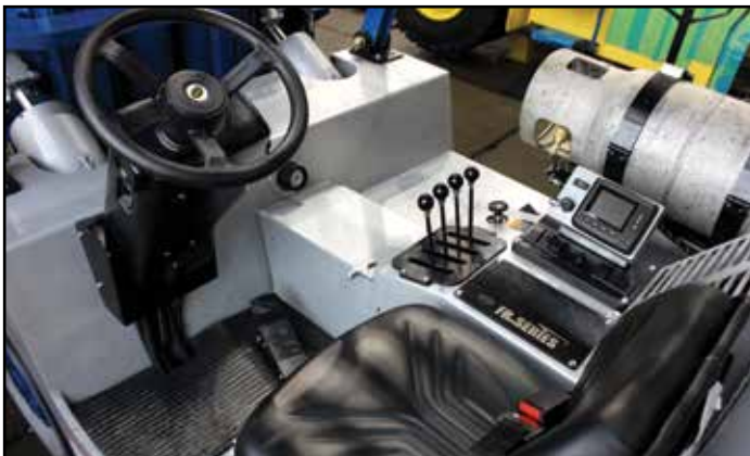
FR 25-35 open cab

MD3 display, located to the right of the operator's seat, provides digital gauges for water temperature, fuel level and oil pressure. Other features of the MD3 display include capacity calculator (pictured above) tachometer, battery indicator, parking brake indicator and RemoteTech warning/service messages.