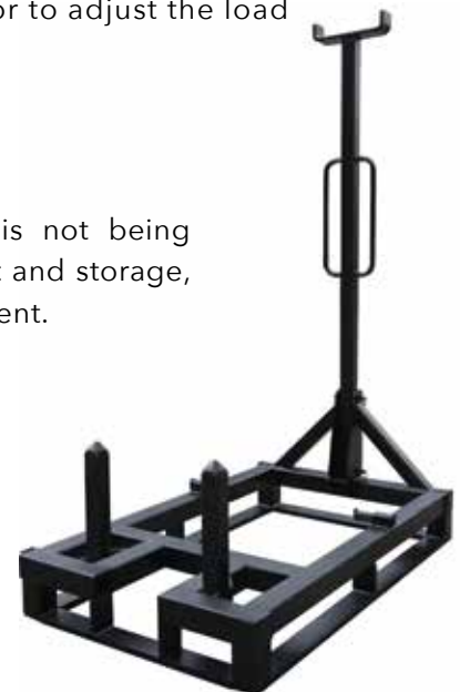
FR Series Boom Stand