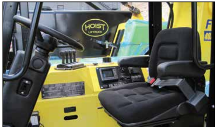
FR 40-60 open cab